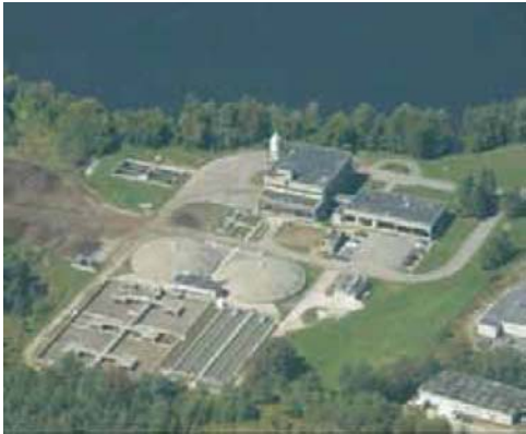
Waste water treatment plant LAWPCA

The waste water operator has to test to measure the status of organisms to know what to add back into the beginning of the secondary clarifier to keep the population where it needs to be. The excess organisms are wasted or sent to the solids handling area, where they are mixed with the primary solids. The laboratory technician and operators will frequently look at the organisms under the microscope and document the types that are present and their apparent health. Treatment plants have to be very aware of the possible pollutants that the plant could expect to receive. If somebody discharges something to that plant that is poisonous to these organisms, secondary treatment can be wiped out and discharge permit requirements of the plant will not be reached. Fines may be given to the treatment plant if permits are not adhered to.