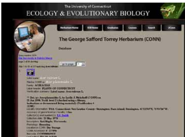
Fig. 1. The UConn herbarium’s web page has a simple search page where students can request information on particular species (Top). The results (bottom) include a list of all the specimens of that species in the database (137 of them in this case)